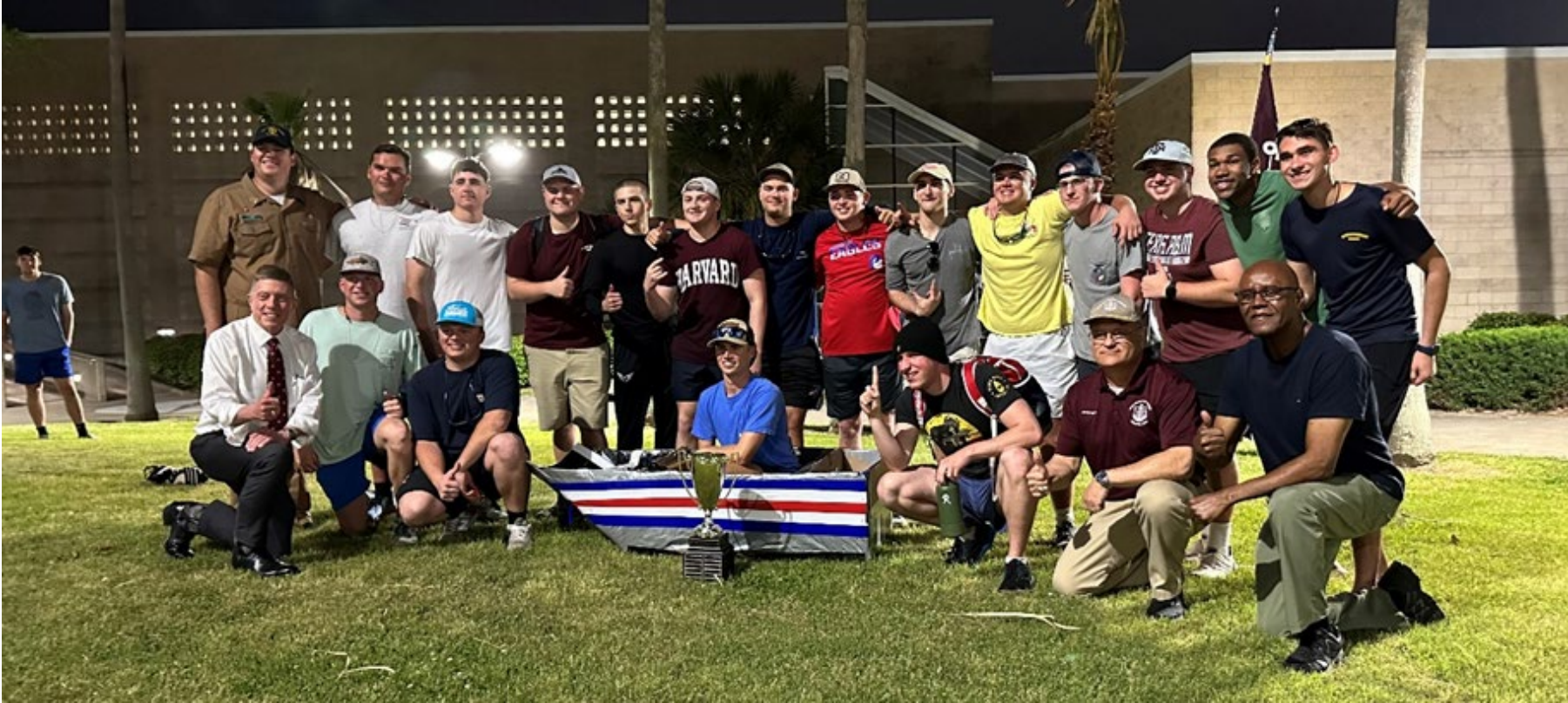
The winner of the Annual Klenczar Cup - Company C-1